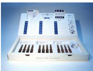
Easy TCA® KIT

Menthol and Camphor: leaves the skin feeling fresh